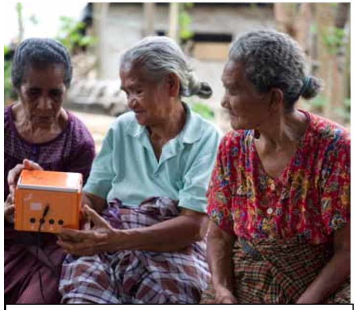
In a region where economic opportunities for women are scarce, the Wonder Woman initiative provides them with a source of independent income.

The Wonder Women initiative is active in two Indonesian provinces, Nusa Tenggara and West Nusa Tenggara, home to 7.3 million people. So far, 185 women have received training in product knowledge, entrepreneurship, sales, marketing, and finance. They now sell energy products, helping their neighbours save an estimated $125.54 USD annually.