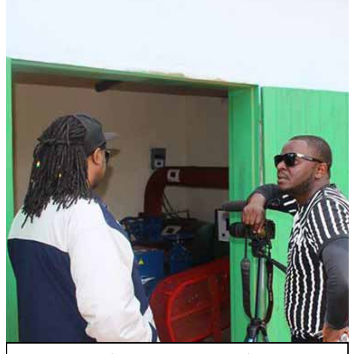
The project aims to foster a more vibrant group of advocates who can demand accountability and advocate strongly for the common good.