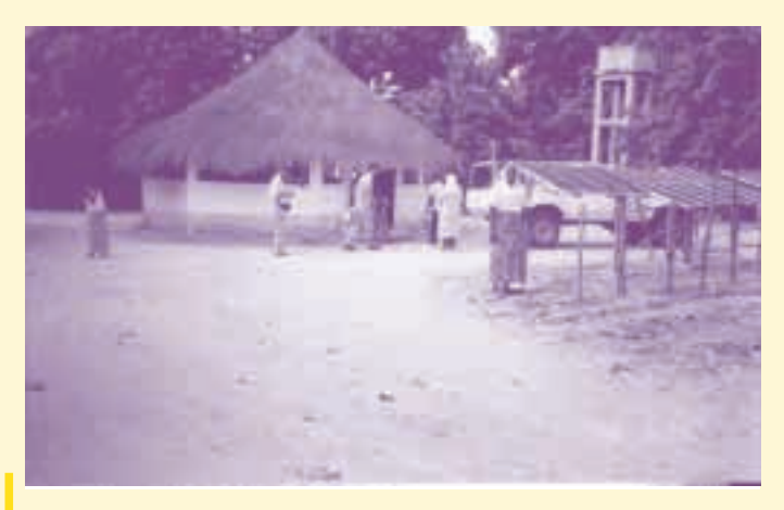
Decentralised energy sources to rural health facilities have helped to improve living conditions by providing benefits that enhance the quality and effectiveness of health care.