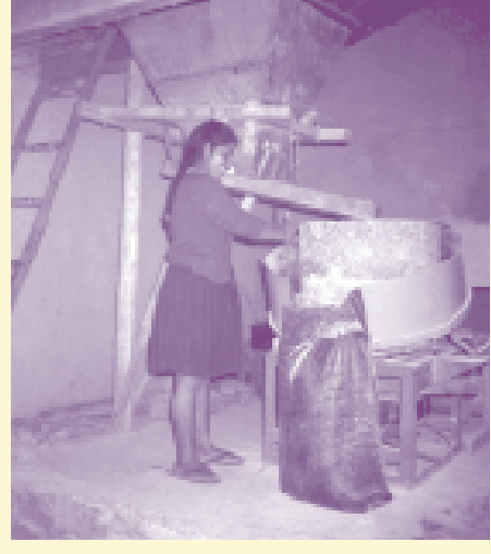
Decentralised energy sources can help reduce the workloads of rural women. This woman in Nepal is grinding grain with equipment powered by a microhydro system.

In rural areas , less than 5% of the population have access to electricity, but a number of large-scale hydropower projects are currently under construction. These will allow rural electrification to expand across the plains, but the steep terrain and scattered settlement patterns in the hill areas will