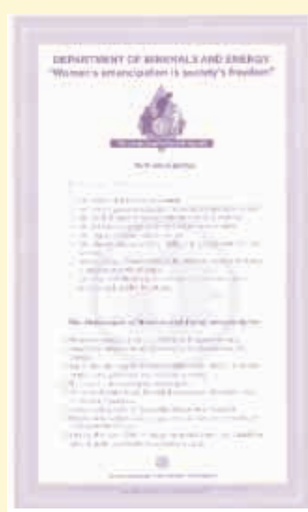
Gender mainstreaming in the South African Department of Minerals and Encrgy is supported by a pledge that male colleagues are asked to sign.

Greater attention is now paid to women's needs, and to addressing gender imbalances in the energy sector. In 1994, a female Deputy-Minister of Minerals and Energy was appointed and, in 1999, following the second democratic elections, a woman, who had long been a champion of gender issues, was appointed as Minister of