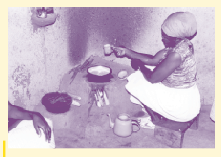
The UPESI (or Maendeleo) stove, which was developed in Kenya, is based on a standard ceramic liner that can be produced and used by artisans and women in the informal sector. The stove uses about 40% less fuel than three-stone open fires, producing up to 60% less smoke.

Over 16,000 stoves have been installed; providing significant poverty alleviation for members of the women's groups and their families, improving the health and saving the time of users of the energy efficient stoves, and also relieving pressures caused by wood fuel shortages.