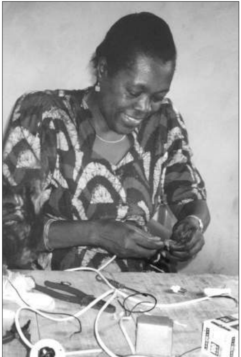
A woman in Ghana participates in the SAWA-TOOL training of trainers programme called 'Towards Technological Empowerment, Technical Training Modules for Women'.