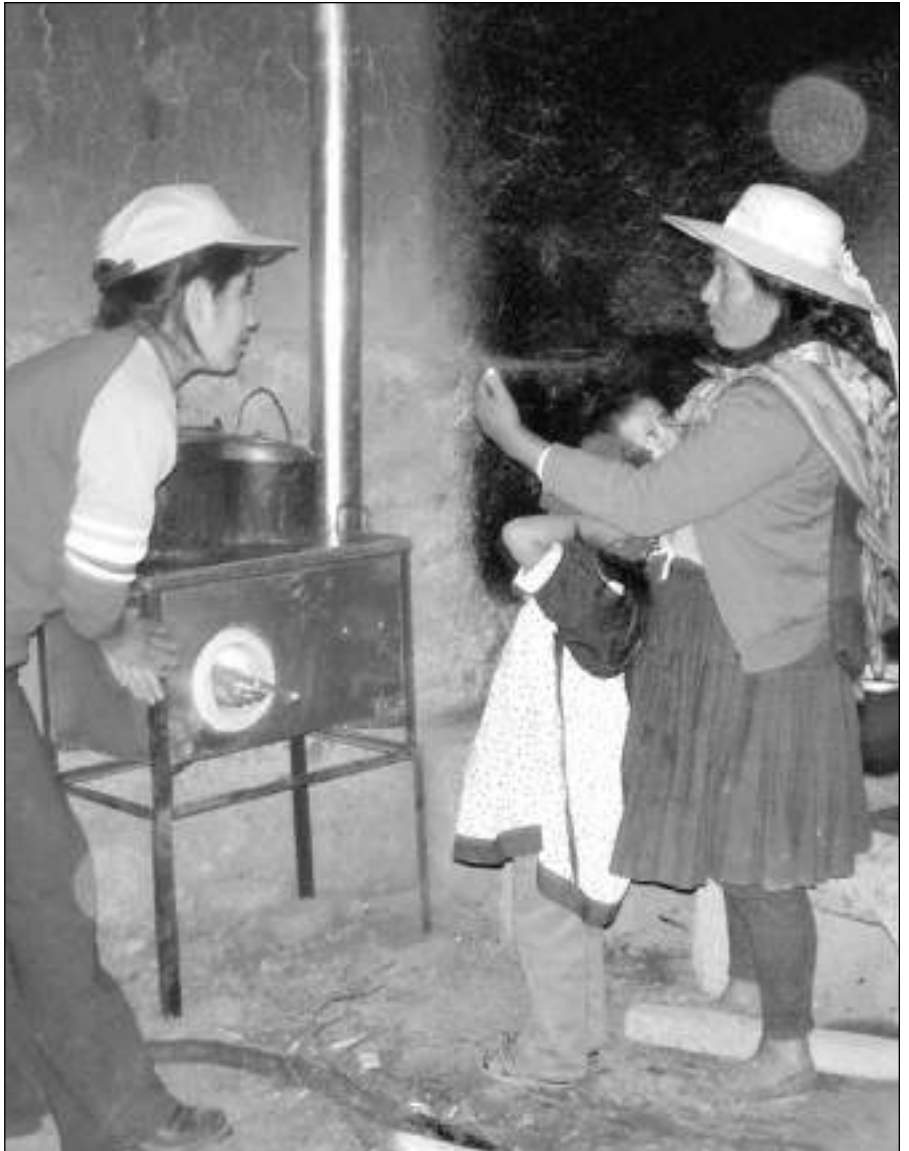
An improved cook stove fitted with a chimney is used in a rural household in Bolivia.