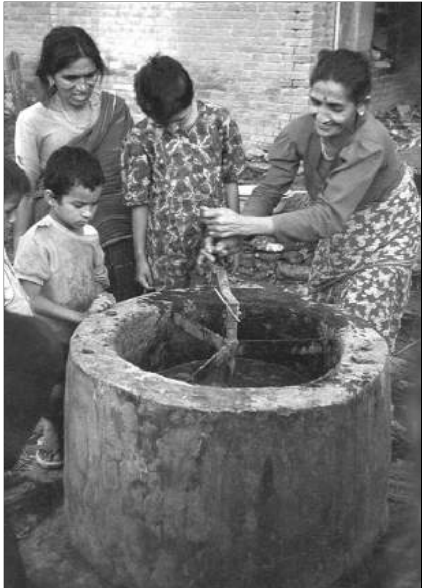
A woman in Nepal operates a bio-digester to produce biogas fuel.