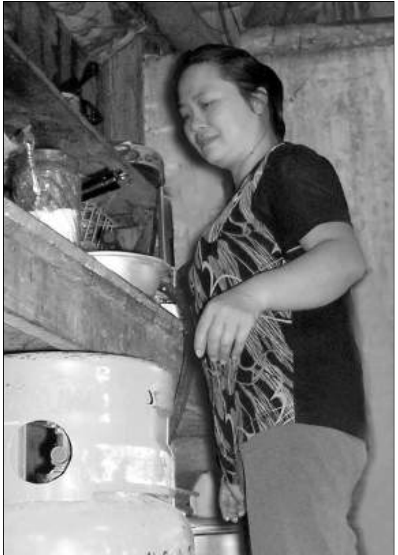
A rural woman in Vietnam uses LPG to cook food in her restaurant business.