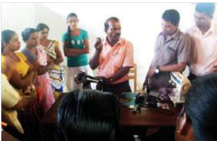
Discussions on repairs and trouble shooting of sewing machines in Ampara, Sri Lanka

Women make a vital contribution to household incomes, particularly in the case of households headed by females. Energy sector strategies and interventions need to enable women to enhance their incomes and livelihoods, for example, through processing of food and crops. They also need energy services for their traditional income-generating activities (e.g. small-scale farming, food processing and informal production and marketing activities) as well new types of entrepreneurial activities.