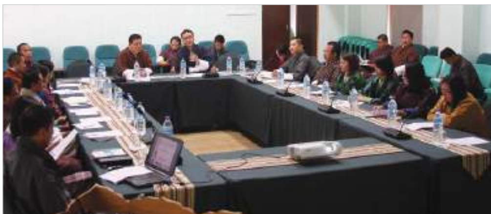
Discussion with stakeholders at knowledge sharing workshop in Bhutan

In addition, the report draws from the deliberations at the three national knowledge-sharing workshops conducted to share findings from the gender review of the energy sector policies and programmes in the respective countries. The national knowledge sharing events were held in Colombo, Sri Lanka on 16 August 2013; in Kathmandu, Nepal on 22 September 2013 and in Thimphu, Bhutan on 1 October 2013.