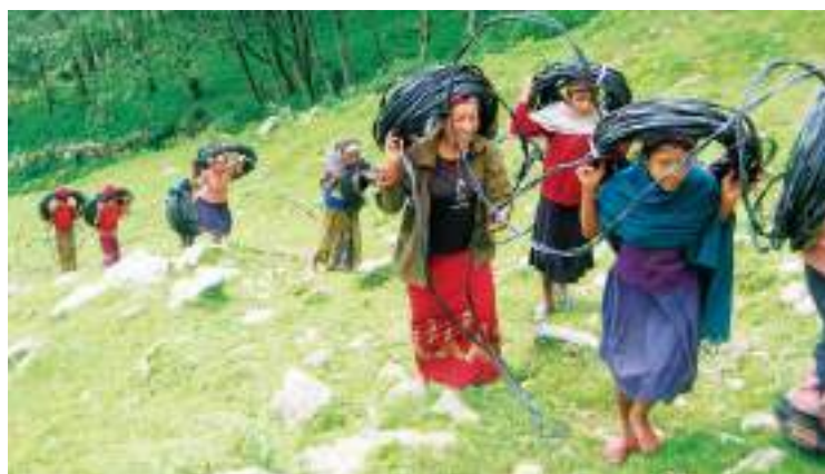
Local community carrying cables for electrification in Nepal

In NRREP, GESI is integrated in all programme elements, starting with the