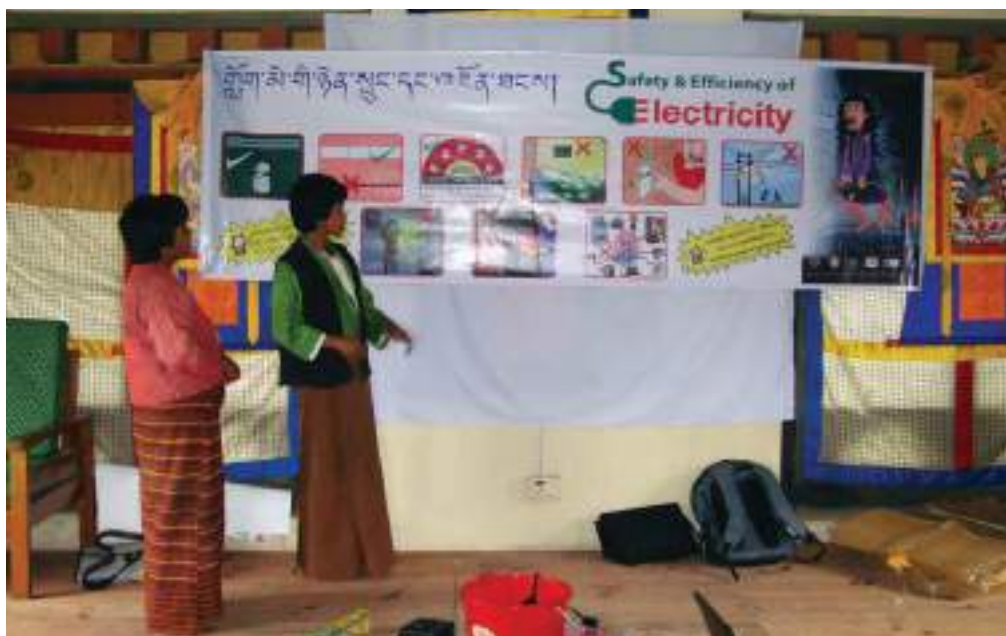
Resource persons at an awareness raising programme on electricity use in Zhemgang, Bhutan

The Nepalese Renewable Energy Subsidy Policy, 2013 recognises and addresses income-related barriers and aims to enable low-income and remote rural households to use renewable energy technologies and attract private sector entrepreneurs. The policy provisions for around 40% of the total cost to be covered by subsidy, 40% by soft loan from financial institutions and the rest (20%) by the community or households in kind and cash.